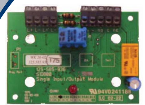
Fig. 1 EV-SIO Single Input/Output Module